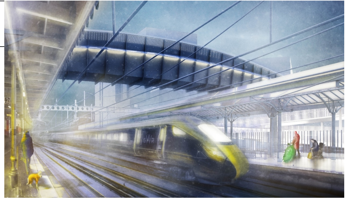
Devon Place Footbridge (artist impression)